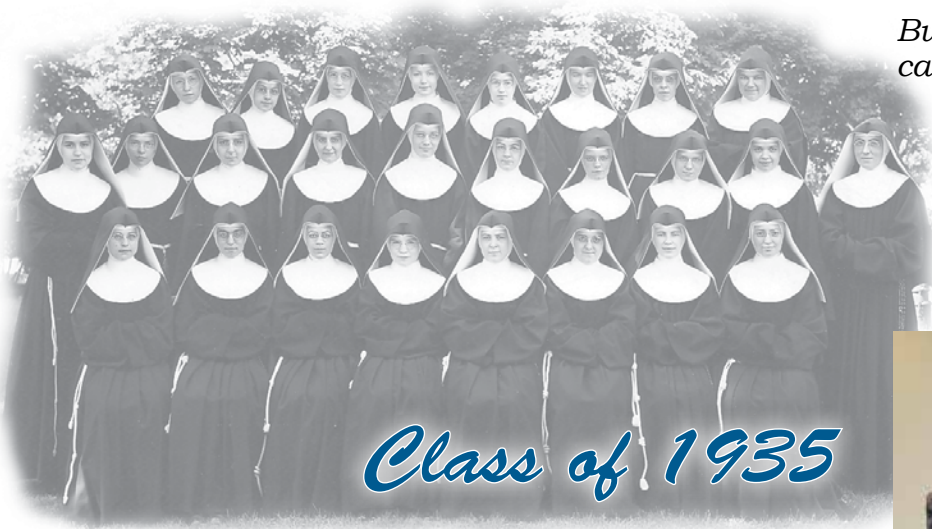
Class of 1935

Building a relationship with God so it can flow out to others.