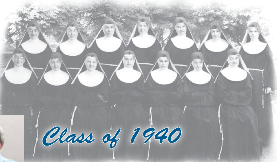
Class of 1940

Renewal and reflection – “Be still and know I am God.”