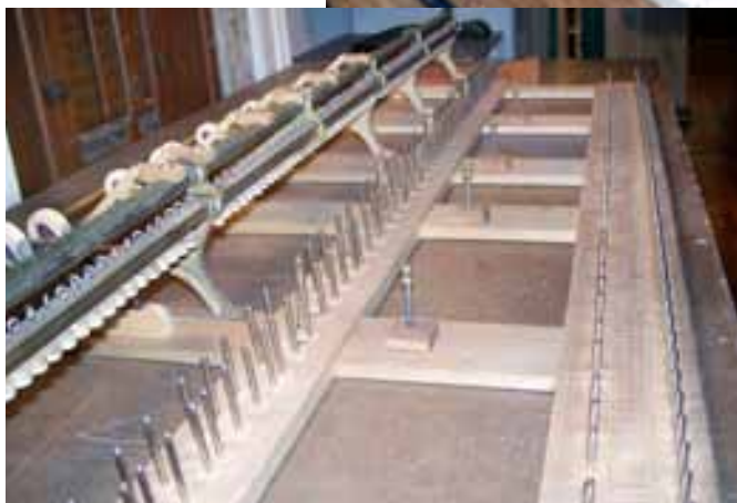
Photos of the disassembled grand piano.

Nojoshing Notes is a publication of the Sisters of St. Francis of Assisi.