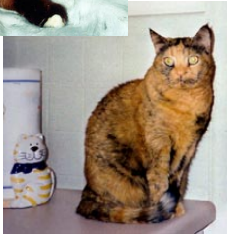
“Chiquita” (right) poses with a “friend” on the kitchen counter