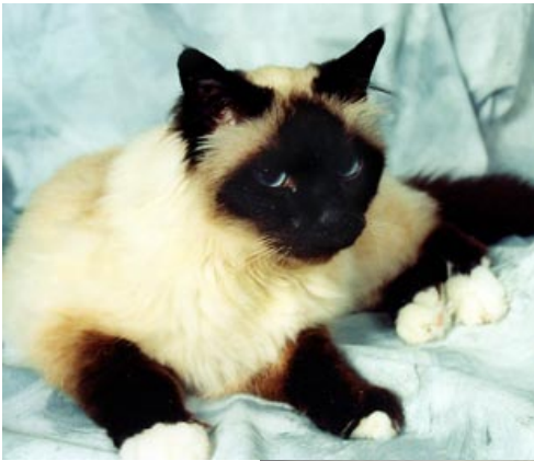
“Oreo” (left) seems very comfortable having her picture taken on a piece of satin cloth