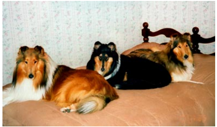
These collies seem to take posing for photos in stride!