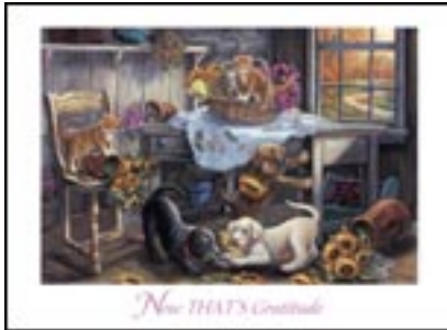
V7183 Now That's Gratitude

NOTE: These cards will be mailed to our previous donors in early March.