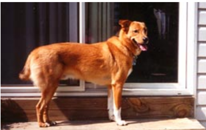
“Cody” is a search-and-(luckily) rescued dog from Texas who was adopted by a donor in Pennsylvania

I f you need to feel God's presence in the world but have your doubts, sit beside the one you love and share a sunset. If you feel moved by the view, if you feel peaceful and connected to the one you love, be assured you have just discovered God's whereabouts.