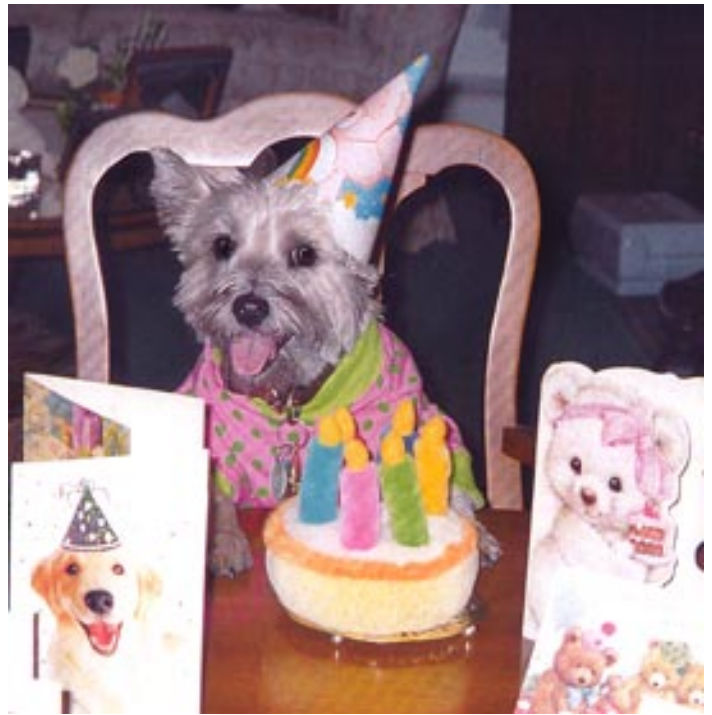
Turning 9 years old was a big event for "Cindy Grace"

S ometimes it is better to wear our hearts right out there on our paws. Being stoic and