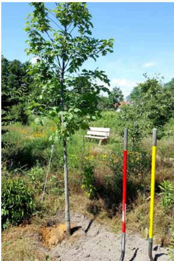
Oak tree planting in the urban forest on the sisters' property in 2016.

As Franciscans, the celebration of Earth Day each spring is a way for us to honor and show respect for creation in the spirit of St. Francis of Assisi. In his Canticle of Creatures, Francis highlights Mother Earth: Praised be You, my Lord, through our Sister Mother