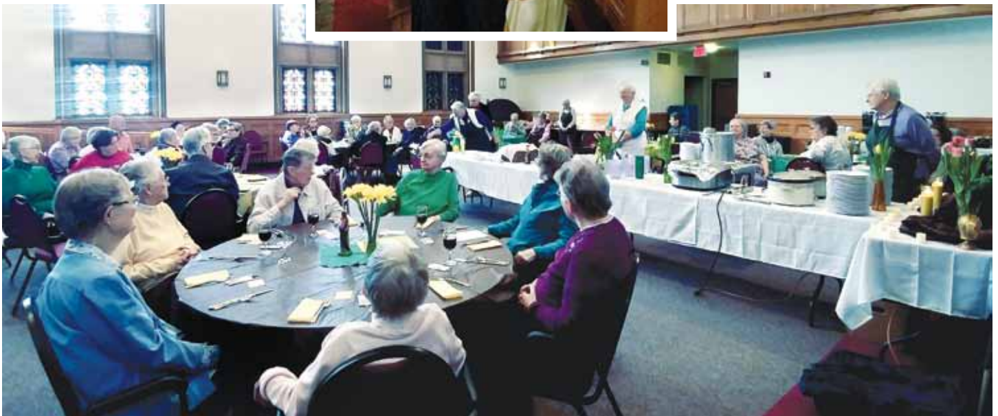
BELOW: A special meal was prepared for the event by a group of sisters.