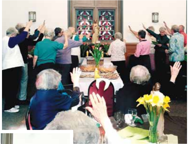
ABOVE: Blessing of the statue by the gathering in Troubadour.

We recommit ourselves to the tradition of asking for St. Joseph's intercession, as we move into our future with our new convent - a practice and prayer that has roots from our very beginning in 1849.