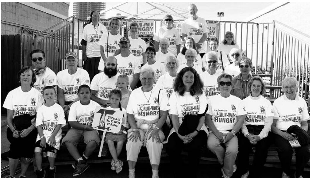
Left: Run- Walk Team. Find more photos on the OSF website ( lakeosfs.org ) or on the OSF Facebook page.