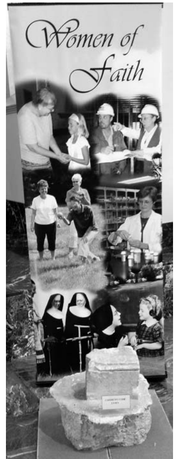
Above: The 1849 Cornerstone was displayed in the Chapel for Foundation Day.