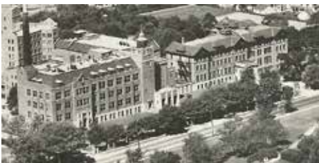
St. Mary's Academy