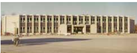
Cardinal Stritch College

1944 June 13: Pope Pius XII grants privilege of perpetual adoration; War Department grants permission to remodel a chapel's wing. September 8: Sisters begin adoration in St. Clare Adoration Chapel.