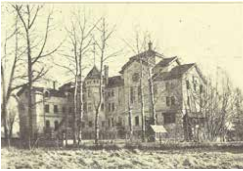
St. John's School for the Deaf