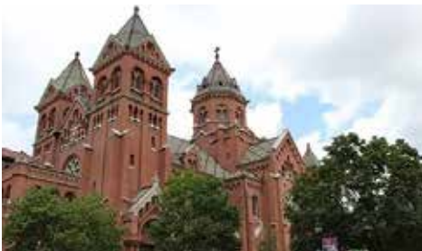
St. Rose Convent, LaCrosse, WI