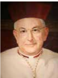
Archbishop Cardinal Stritch