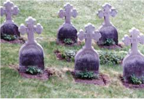
Gravestones of Foundresses