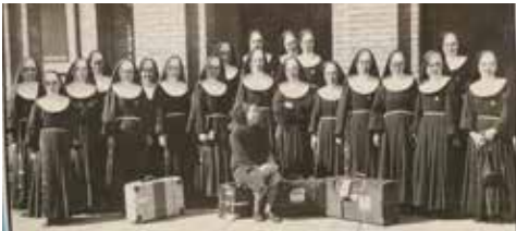
Chinese and American Sisters arriving in the US