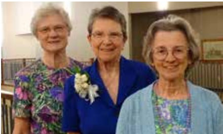
Leadership Team – 2023

Sale of St. Clare Court in Baltimore to Homes for America