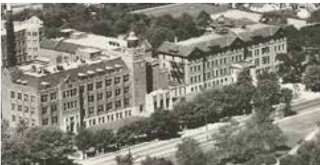
St. Clare College, forerunner of Cardinal Stritch University