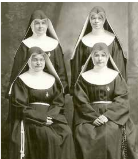
First group of missionaries sent to China

1904 St. Mary's Academy for girls opens on convent grounds