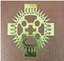
Call and Response

Committee work: Major vehicle for implementing the acts of Chapter. Newly written Constitutions, "A Call to Community," provisionally adopted.