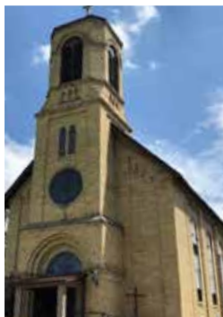
St. Lawrence Church

1856 Dedication of St. Francis de Sales Seminary – built on land originally purchased by the Ettenbeuren Tertiaries.