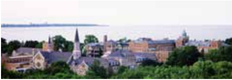
Skyline prior to deconstruction of Motherhouse and St. Mary’s Academy, 2017

Navigates congregation through Rome’s Apostolic Visitation; as LCWR President, becomes “spokesperson” for women religious in United States.