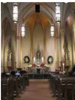
St. Francis Chapel, prior 2019