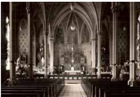
St. Francis Chapel