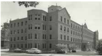
St. Ann Health Center