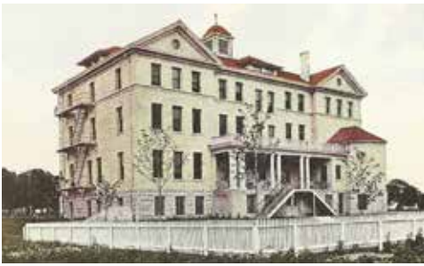
St. Mary's Academy first building