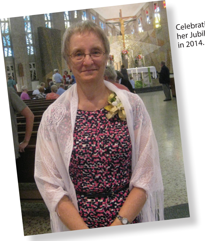
Celebrating her Jubilee