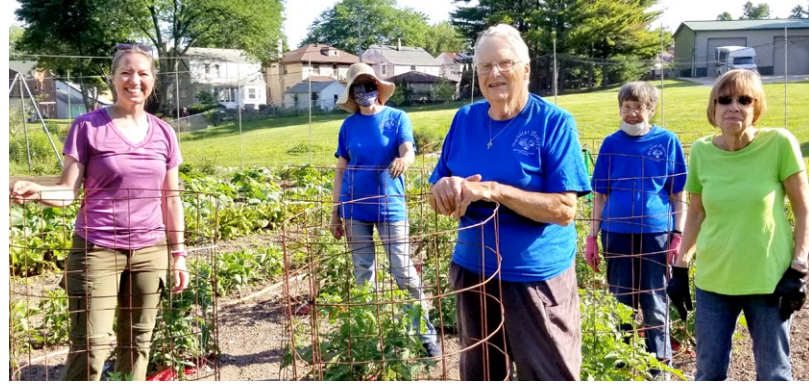
As Franciscan women with a commitment to caring for all of creation, the Sisters of St. Francis of Assisi use environmentally friendly or post-consumer paper and soy ink whenever possible.