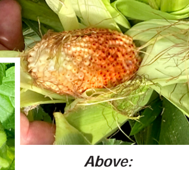
Above: Strawberry popcorn cobs were used with the husks to form flowers on the tree